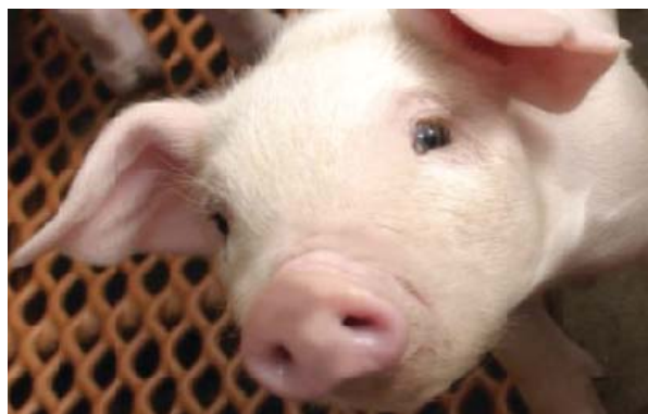
Table 2. The effect of creep feeding in the farrowing room on feeder visits in the nursery.

Piglets who had access to creep feed in the farrowing room had fewer visits to the feeder in the nursery on day 0, 1 and 4 post-weaning. This pattern is most notable in the final 8 hours of each 24 hour period. Again, this is contrary to our hypothesis, that feeding creep would accustom the piglets to solid food and thus encourage consumption in the nursery. Feed intake was comparable, thus it appears that those piglets who had received creep feed in the nursery consumed more feed at each visit when in the nursery. The increased visits by the pigs who hadn't received creep during the final 8 hours of each day could be because these piglets, unaccustomed to the solid feed, were consuming less feed with each visit, and are then motivated by hunger to visit the feeder during the latter part of each day. This awaits confirmation.