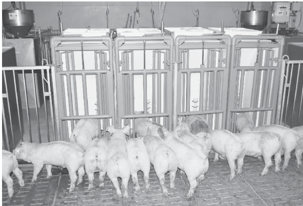
Precision feeding test with prototype feeding station.

Dairy and Swine Research and Development Centre (AAFC), Quebec; Université de Sherbrooke, Quebec; Université Laval, Quebec; Centre de développement du porc du Québec inc.; Prairie Swine Centre, Saskatchewan; Universitat Lleida, Spain; Institute i Tecnologia de Recerca Agroalimentàries (IRTA), Spain; Institut National de la Recherche Agronomique, France; Universidade