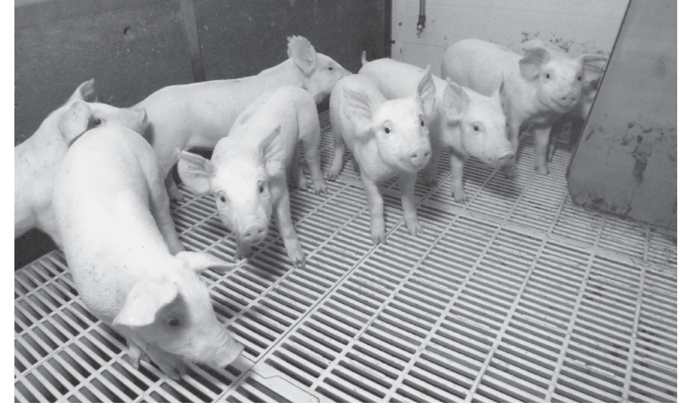
Feeder space per pig in the finishing barn can have a significant impact on growth rate

diet composition. Having said that, he stresses that the feed production components should be checked to ensure that feed delivered to the pigs meets their requirements for daily nutrient intake. "We need to confirm the composition of incoming ingredients in terms of both desirable and undesirable constituents," he explains. "We also need to ensure that feed mixing is achieving