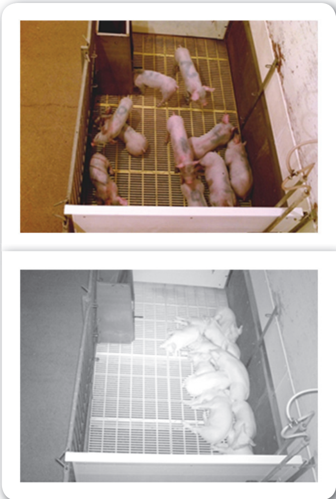
Figure 1. Still photos used to monitor piglet behaviour during a light or dark period.

We are grateful for support for this project from the Saskatchewan Agriculture Development Fund. Program funding for Prairie Swine Centre, Inc. from Sask Pork, the Manitoba Pork Council, Alberta Pork, and Ontario Pork is gratefully acknowledged.