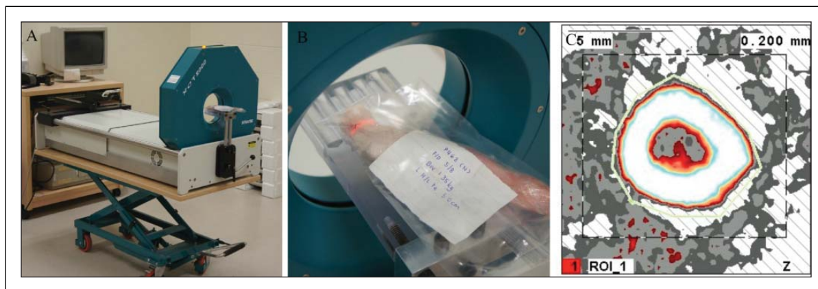
Figure 1. Peripheral quantitative computed tomography (pQCT) scan in the midshaft of the femur in a newborn piglet left hind limb; (A) Norland/Stratec pQCT, (B) Limb positioned perpendicular to the laser of the gantry, (C) Scanned region of interest (ROI) at femur midshaft.