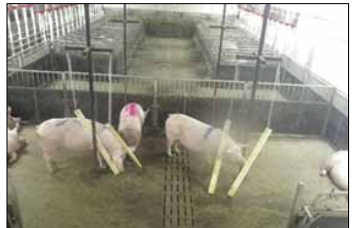
Sows at the Prairie Swine Centre interacting with the block of wood enrichment.